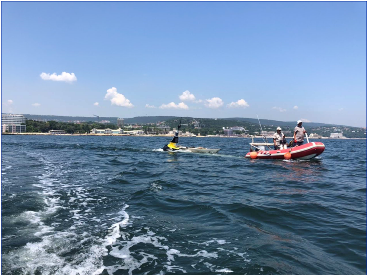
A snapshot of the Oceanographic Station deployment operation in Varna bay