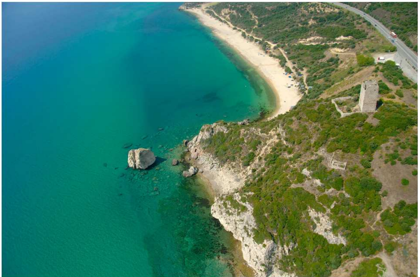
Apollonia Tower in Paggaio Municipality

In effect, attendees and speakers will include numerous representatives from local authorities, engineers from the public sector and leading Coastal Zone Management experts from top Universities in Greece, Cyprus, Bulgaria and Albania.