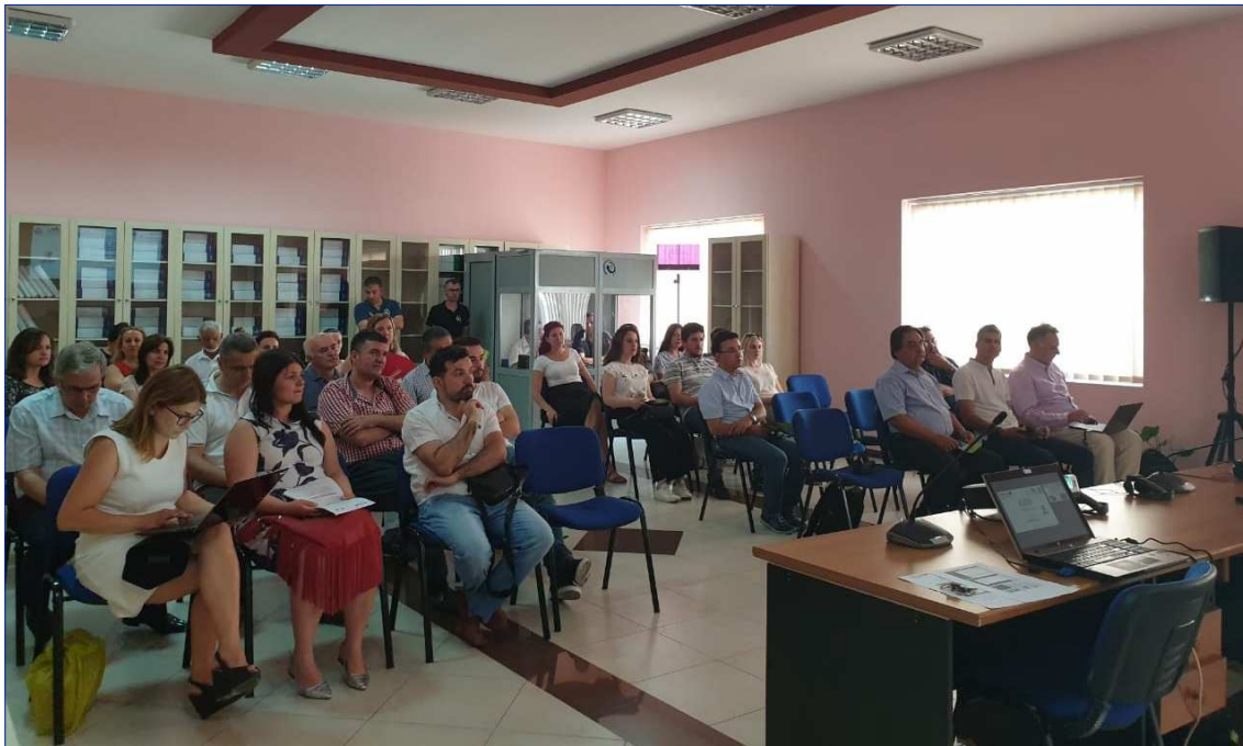
HERMES Workshop at IGEWE premises

These users can range from local authorities, to fishermen, industry, hotel owners and professionals who work at the sea or / and the coast and need the information to improve their performances. How to take care of the environment while harnessing sustainable place-based development was in simple terms the main topic of the Open Workshop.